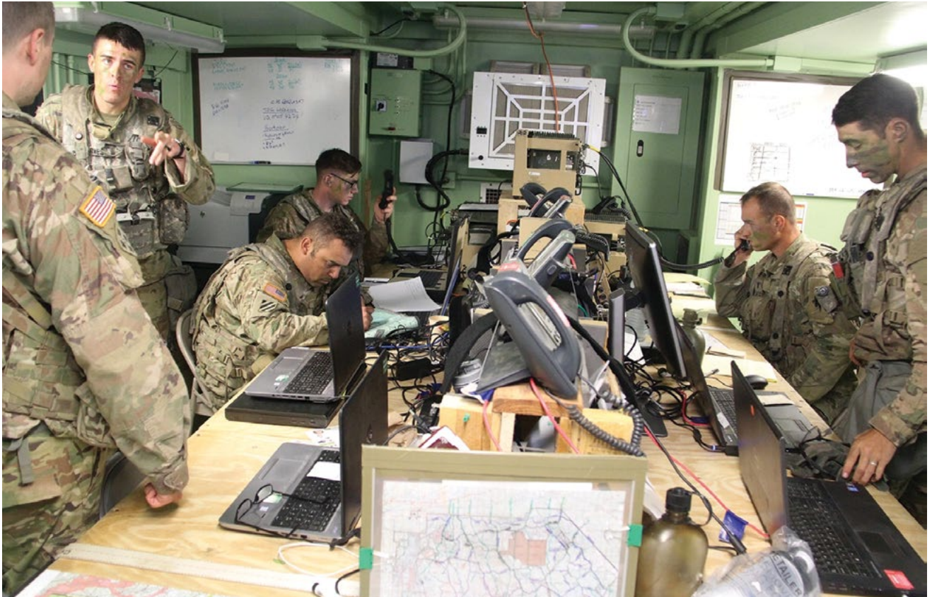
Members of the 1st Battalion, 12th Infantry Regiment, 2nd Infantry Brigade Combat Team, 4th Infantry Division, work inside their mobile tactical operations center at the Joint Readiness Training Center, Fort Polk, Louisiana.

tools. While this initially manifested in the form of an ever-expanding functionally dedicated staff, today it also appears in the form of computer servers and the digital applications required for processing and discerning meaning from the sea of data in which our operations are now awash. 21 This insatiable demand for decision-quality information to enable understanding and commander visualization has only increased over time. In the current form, these tools and staff weigh on the agility of the command-and-control system and increase its vulnerability by orders of magnitude.