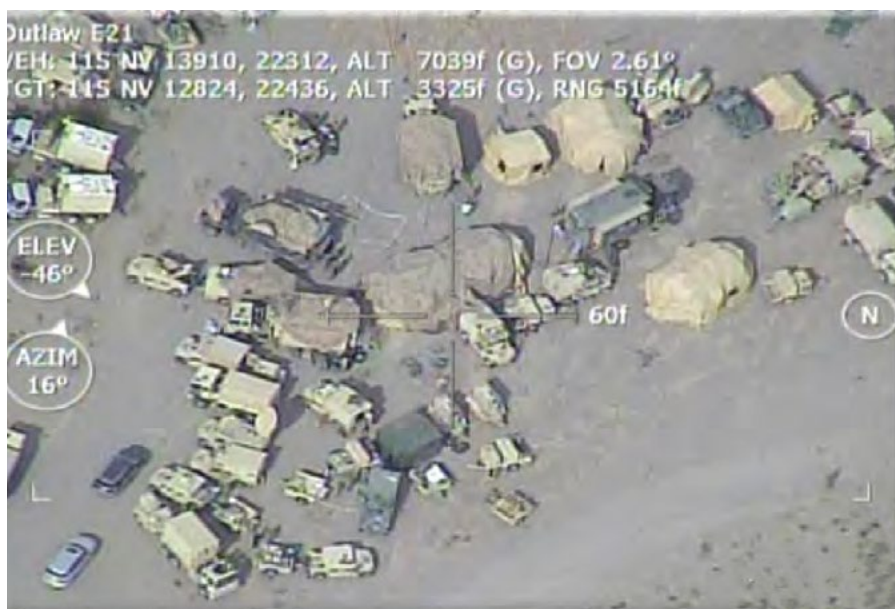
Top photo: A close examination of this screen shot of the destroyed Russian army position 13 March 2022 reveals that the Russian command post configuration of vehicles and structures in the early stages of the invasion closely resemble most current U.S. command post configurations.