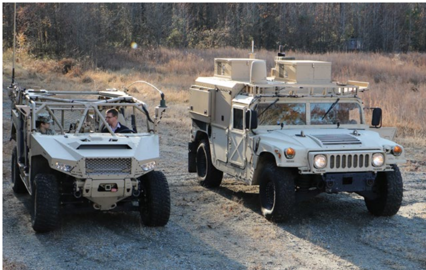
The Department of Defense has selected a mobile power program from Army Futures Command to increase the speed at which on-the-move power capabilities are delivered to the battlefield.

Tzu dictum that “all warfare is based on deception” and applies it to our command posts, thereby setting the tone we hope is reflected in the operations they direct. 38 We must also not forget that survivability, whether physical, informational, or human, is just one aspect of endurance. Endurance also has a sustainment aspect, which implies that whatever command-and-control system is fielded, it must be capable of operations for an indefinite period. In the past, this may have implied a mountain of logistics and personnel to support work–rest–maintenance cycles. In the future, this problem may be overcome by simply transferring mission command to any one of many distributed command-and-control nodes within a constellation of distributed nodes in much the same way industry manages global workflows.