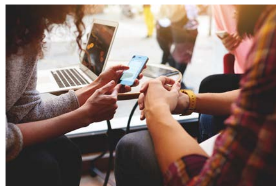
Learning that Fits mheducation.link/smartbook2